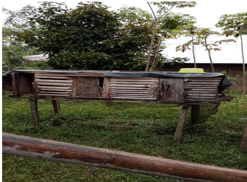
Figure 1. Condition pen Before Implementation Activity