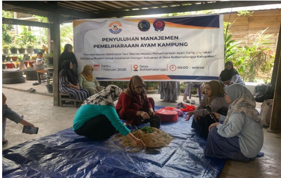
Figure 3 Counseling Management Maintenance Chicken village And Fermentation Feed Chicken Village made from Feed local