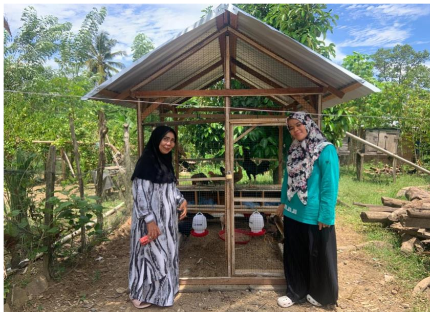
Figure 2. Condition pen after implementation activity