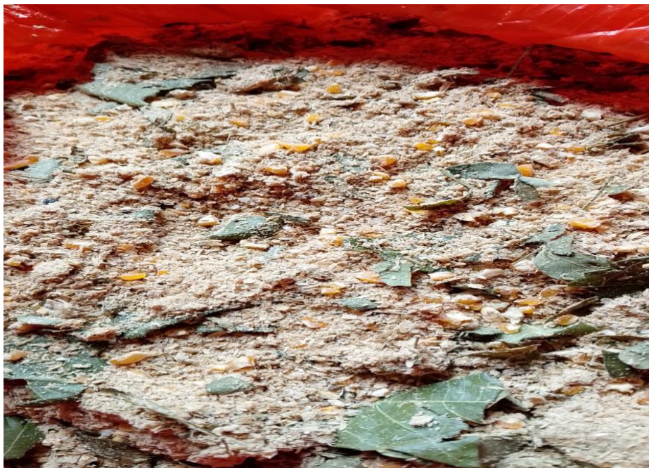
Figure 4. Results Fermentation Feed